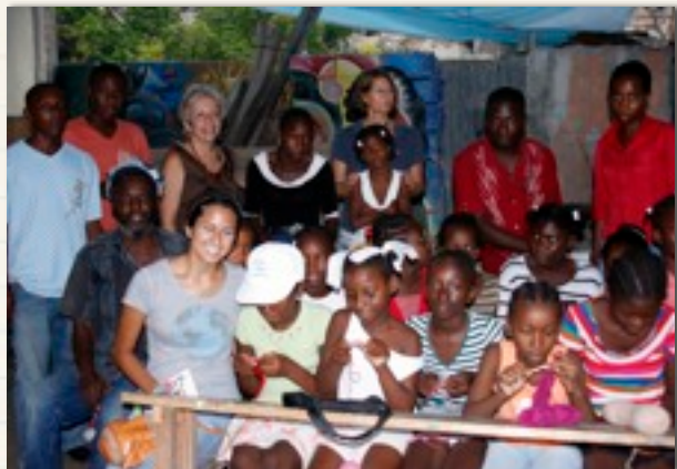
Children at the Arts Center in Port-au-Prince, Haiti. Children's Enrichment Center will be conducted at the Arts Center.